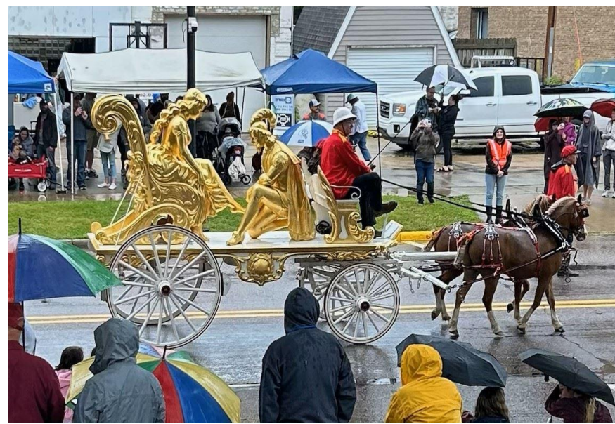
Photo of the Barnum & London Circus Cinderella pony float