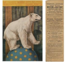
Walker L. Main Trained Wild Animal 3 Ring Circus, est. $800.000