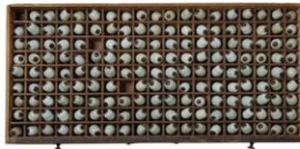
Prosthetic Glass Eye Collection, est. $2,000.000

Our annual sale of the UNUSUAL, the AMAZING, and the BIZARRE is set to feature a wide range of AMAZING antique objects, from classic VINTAGE lithographs (and the maquettes used to design them), to REMARKABLE cabinet cards and photographs, sideshow banners, and fairground art, including carousel animals and horses. STRANGE taxidermed items will also cross the block.