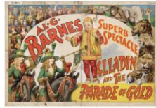
Al G. Barnes Superb Spectacle Adults and The Parade of Gold, est. $800.000