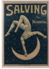
Salving the Phenomenal, est. $500.000