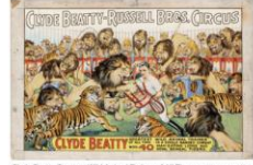
Clyde Beatty Greatest Wild Animal Trainer of All Time poster maquette, est. $800.000