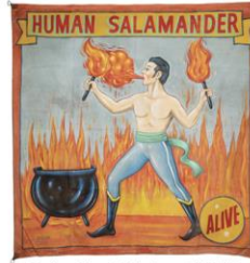
Jack Cripe, Human Salamander sideshow banner, est. $2,000.000