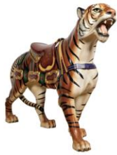
Dented Carcass Tiger, est. $10,000.000