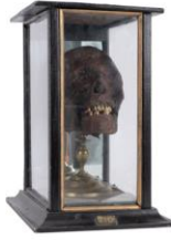
"Mummified" Head in Case, est. $600.000

Our annual sale of the UNUSUAL, the AMAZING, and the BIZARRE is set to feature a wide range of AMAZING antique objects, from classic VINTAGE lithographs (and the maquettes used to design them), to REMARKABLE cabinet cards and photographs, sideshow banners, and fairground art, including carousel animals and horses. STRANGE taxidermed items will also cross the block.