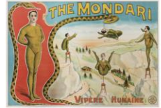
The Mondari Viper Humaine, est. $800.000