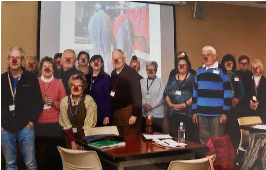
Under the Big Top class, winter 2019

Recognizing our members and their dedication to the preservation of circus history.