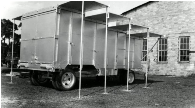
( 1953 at Sarasota WQ)

The Circus Hall of Fame will be having their annual work week May 19 th – 25 th , 2019. Volunteers are urged to come help. Workers can be found painting wagons, cutting trees, sandblasting, building, welding, etc. They will be giving a particular emphasis on restoring the former Ringling Bros. and Barnum & Bailey Circus Bandstand wagon. New tires and bearings have already been installed. Feel free to contact them at circushalloffame@gmail.com There is room for travel trailers or motor homes at the Circus Hall of Fame in Peru, Indiana.